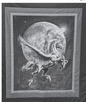
Some of the wonderful auction items from 2021.